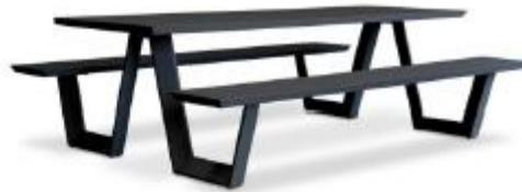
240mm x 160mm six-seater commercial grade table (photo indicative only – not actual table)