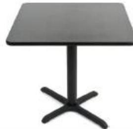
700mm x 720mm four-seater commercial grade table x 2 (photo indicative only – not actual table)